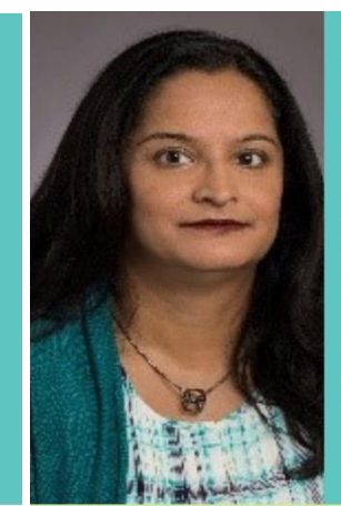
"As a family caregiver who works in home and community care, I joined the OCC to support caregivers through education, innovative problem-solving, and advocacy."

Building a Better Ontario for Caregivers. One Voice at a Time Join us at www.ontariocaregivercoalition.ca