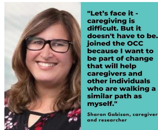
"Let's face it caregiving is difficult. But it doesn't have to be. I joined the OCC because I want to be part of change that will help caregivers and other individuals who are walking a similar path as myself."

This year's theme, "Building a Better Ontario for Caregivers, One Voice at a Time", will continue to guide our outreach and engagement work this year, as we continue to showcase how involvement with the OCC helps all of us on our journey towards change for current and future caregivers.